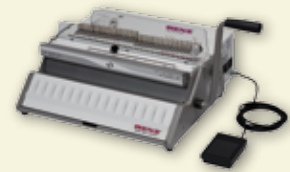
SRW 360 comfort / eco 360 comfort

In only 3 minutes changed from a manual to combined electric punch and manual closing machine.