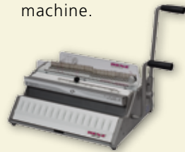
SRW 360 / eco S 360

Fast and easy change of the new SRW 360 / eco S 360 in only 3 minutes from a manual operated machine into a combined electric punch and manual closing machine.